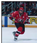
8:30 am: Olympic Gold Medalist Cheryl Pounder