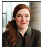
12:30 pm: Olympic Gold Medalist Clara Hughes