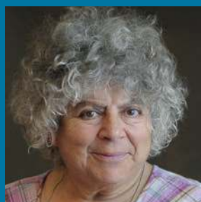
Miriam Margolyes OBE Actress and Age UK Ambassador

'How important it is for all of us that the services we depend on feel safe and welcoming. Unfortunately, for many older people who are lesbian, gay, bisexual or transgender, living through far less enlightened times has meant it is all too easy to expect the worst. This guide offers practical advice on being the kind of service in which older LGBT people can feel safe to be themselves. As well as the bigger issues, it stresses that it is often the simple things that make a difference – being aware, using inclusive language, not making assumptions. I hope it will be widely used.'